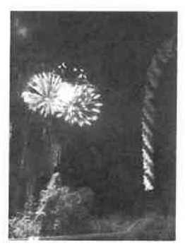
Rain Date: Sunday, September 9th 2:00 PM- 8:00 PM, Fireworks at 8:00 PM