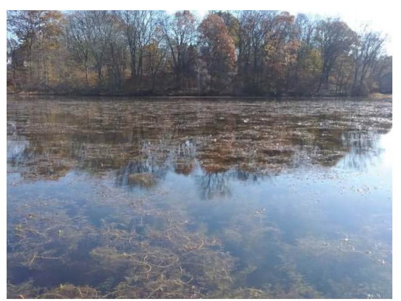
Water Milfoil in Lake Meahagh Associated with Sample Location S2, Northern End of Lake