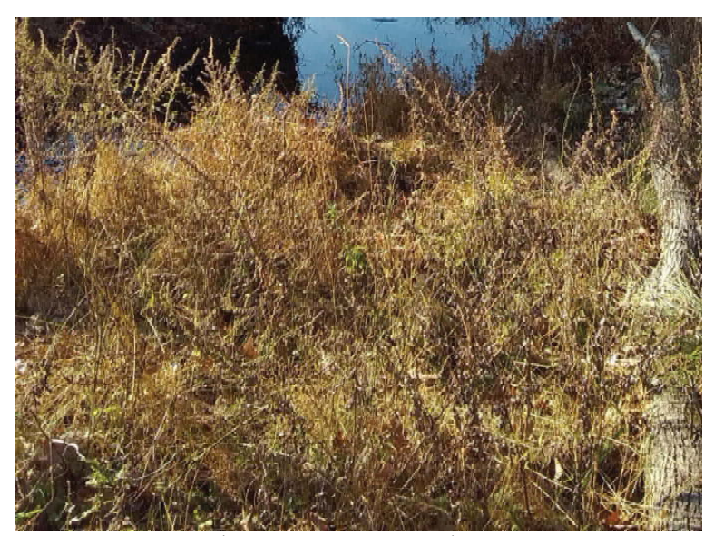
Japanese Knotweed (Polygonum cuspidatum) Associated with T5, East Central Tributary