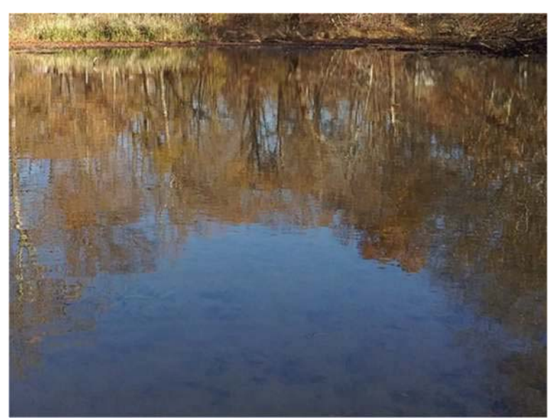
Water Milfoil Associated with T3, North Tributary