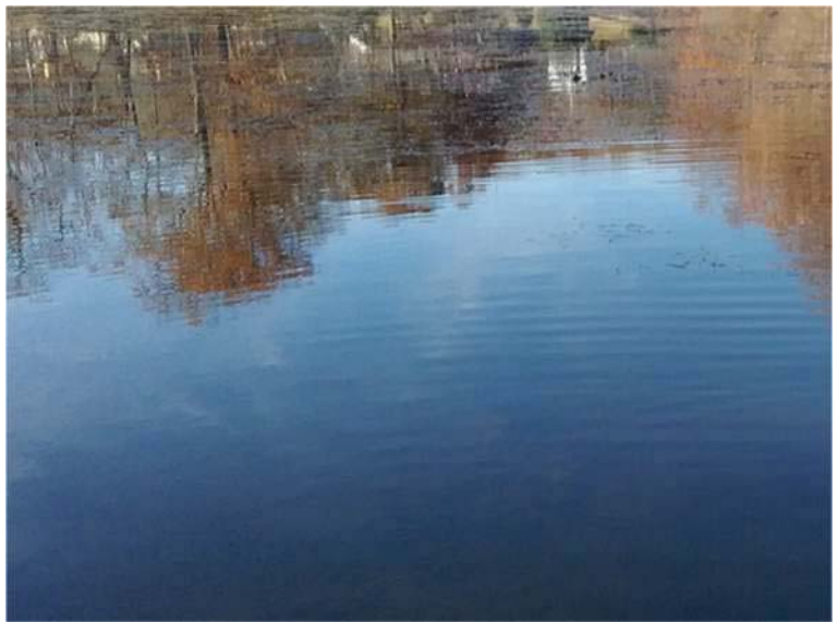
Water Milfoil Associated with T4, Northeast Tributary