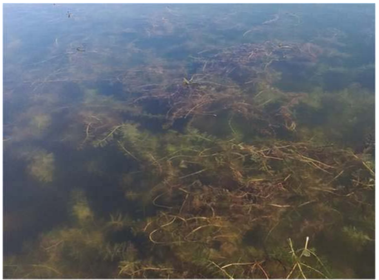
Water Milfoil in Lake Meahagh Associated with Sample Location D1 - Near Lake Outfall