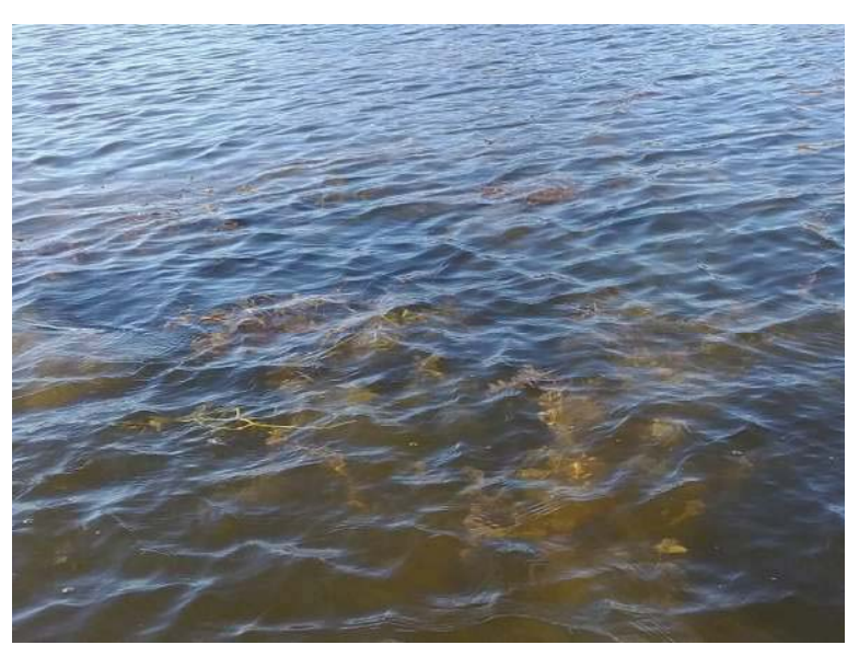
Water Milfoil in Lake Meahagh Associated with Sample Location S1, Southern End of Lake