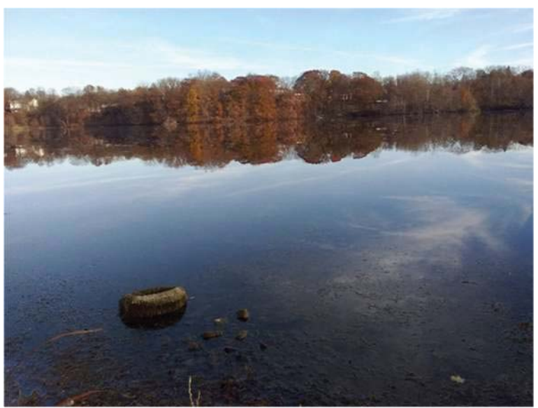
Water Milfoil ( Myriophyllum spicatum ) and Periphyton Associated with T1, Southwest Tributary