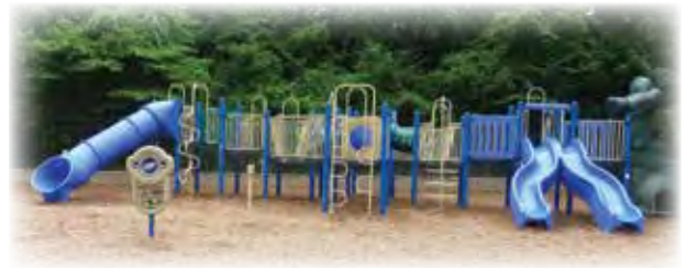
Sprout Brook Park Playground 130 Sprout Brook Road, Cortlandt Manor