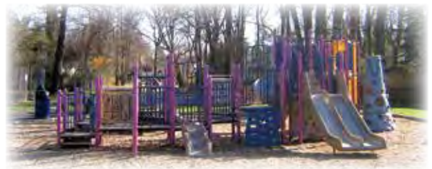
Tommy Thurber Park Playground 10 Bonnie Hollow Lane, Montrose