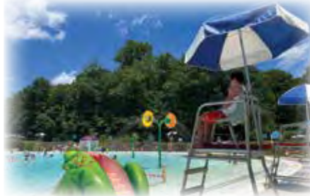
Charles J. Cook Recreation Center