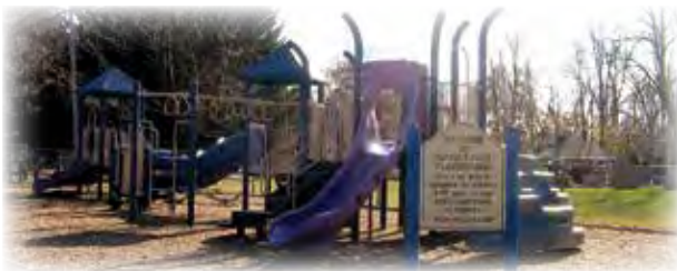
Sunset Park Playground Sunset Road, Montrose