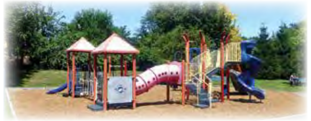
Old Pond Park 8th Street, Verplanck