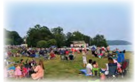
Cortlandt Waterfront Park