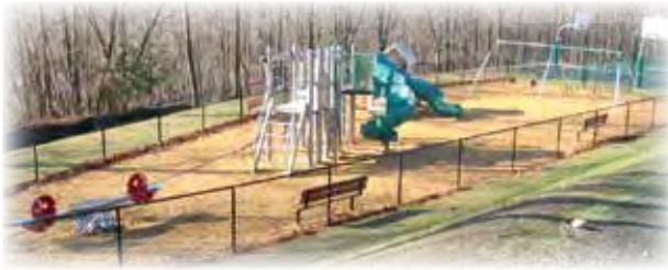
Cortlandt Community Recreation Area Croton Avenue, Cortlandt Manor