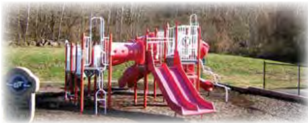
Peter Cutignola Memorial Playground 1 Memorial Drive, Croton