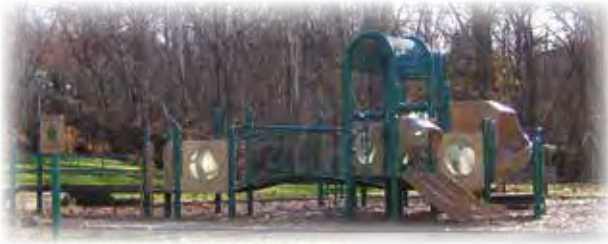
Muriel H. Morabito Community Center Playground 29 West Brook Drive, Cortlandt Manor