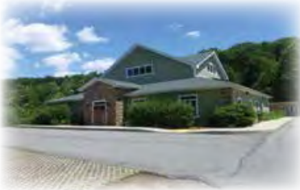
Town of Cortlandt Youth Center